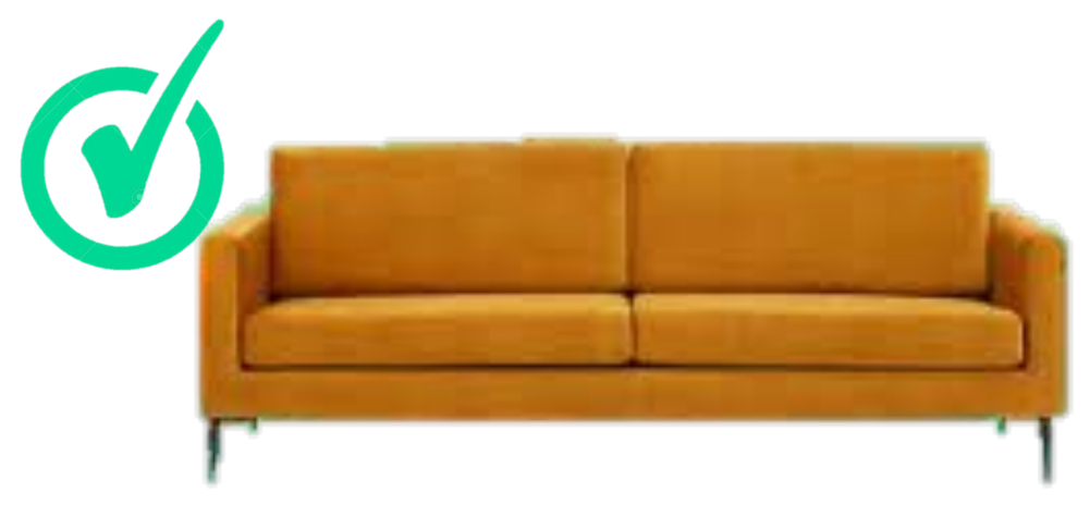
Clear of clutter, straight on so the item can be dropped into a visual, fully in frame